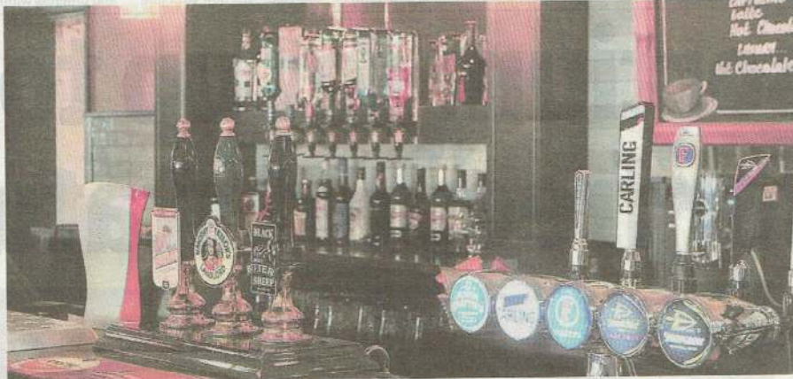
Prohibition has stopped pubs and restaurants serving alcohol

"Businesses feel incredibly hard done to in the North given our Covid-19 infection rates and the hard work and invest-